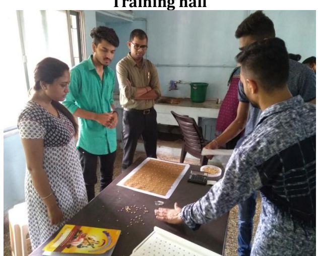
Seed Testing UG Lab