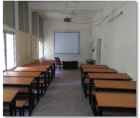
U.G. Class Room